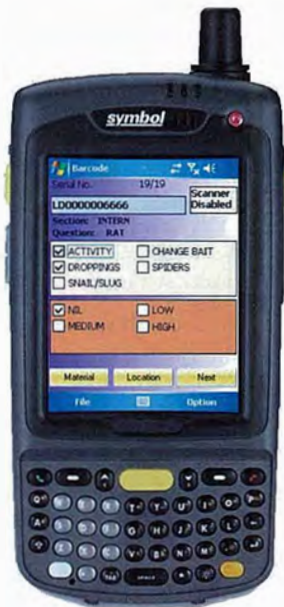
Higher level of service using hand held scanning, recording and reporting technology.

"With rodent management, no matter how large or small the job, our barcoding software makes locating and monitoring stations, measuring bait and material usage, ▷